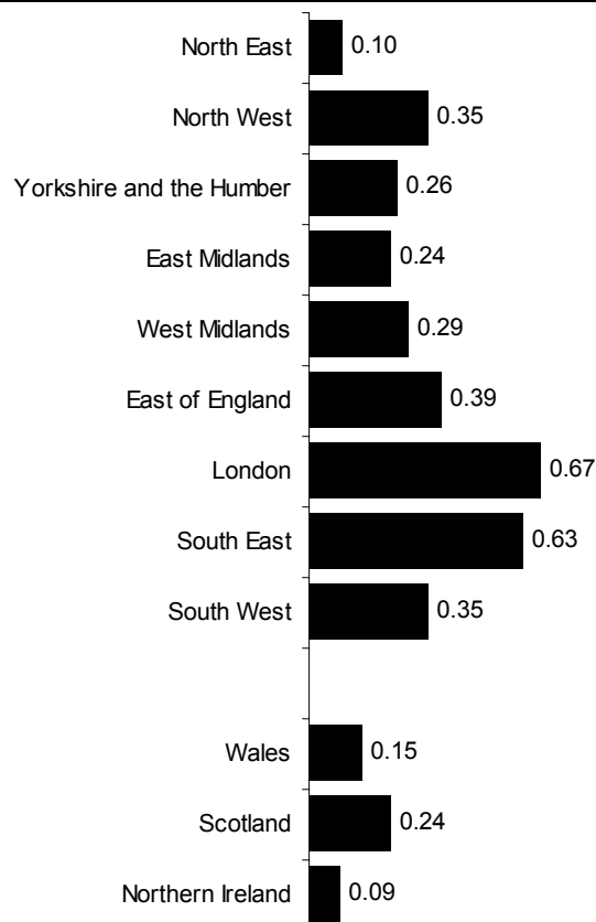
Figure 1 Number of businesses in UK and regions (millions)

These statistics contain estimates of the regional business populations, breaking down the estimated UK population of 3.75 million active businesses. For each region statistics are provided with a size and industry breakdown of the number of businesses, employment and turnover, within the private sector and public corporations.